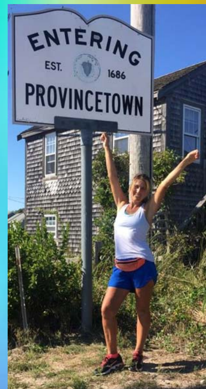
End of a long journey. September 15, 2015