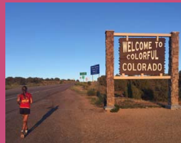
Running for the Rockies.